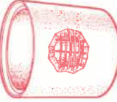
● REINFORCED CONCRETE PIPE 6" TO 60"